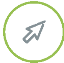
Assistive Technology and Personal Support Services