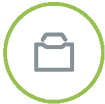
Employment Training and Support