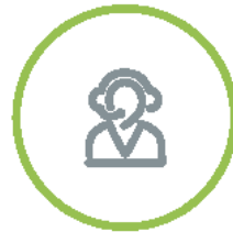
Oversight and Monitoring