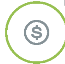
Other Expenses Approved by the Treasury Regulations