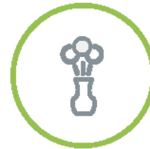
Funeral and Burial