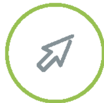
Assistive Technology and Personal Support Services