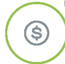
Other Expenses Approved by the Treasury Regulations